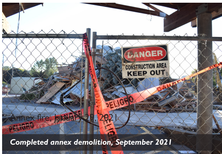
Completed annex demolition, September 2021