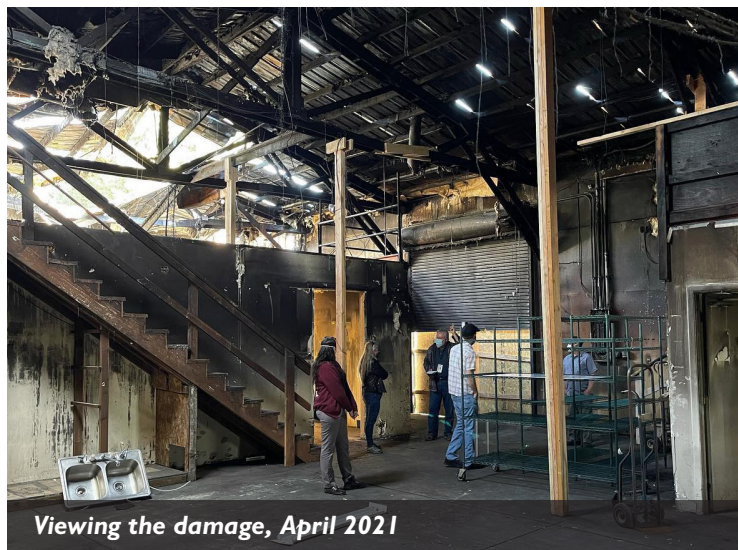
Viewing the damage, April 2021

We are also exploring the possibility of incurring a small number of construction loans directly from Owners. We have used this method successfully in the past for targeted funding situations, and it is beneficial for both