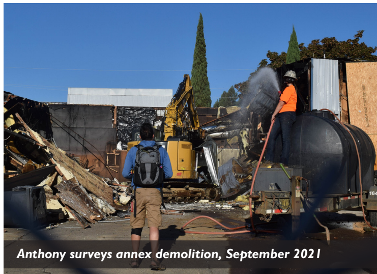
Anthony surveys annex demolition, September 2021