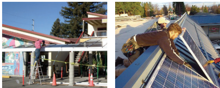
Our current solar panel arrays being installed at South Store (left) and North Store locations between 2008-2009

This installation is the 10th project for Solarize Corvallis, a joint partnership of the Corvallis Sustainability Coalition and the Oregon Clean Power Cooperative. Solarize Corvallis is a grassroots initiative to put large solar arrays on as many buildings in our community as possible by the year 2025. Previous installations in our community have included four Corvallis School District projects, Benton County's Kalapuya Building, two nonprofits, a business, and a church.