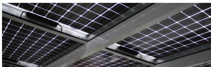
Bifacial solar panels over the South Store bike parking collect light reflected back from the concrete in addition to the direct sun light

The final design may change before construction starts, but we expect to install 70 kW of roof-top solar panels at the North Store and 80 kW of solar at the South Store.