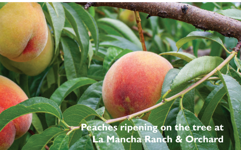
Peaches ripening on the tree at La Mancha Ranch & Orchard